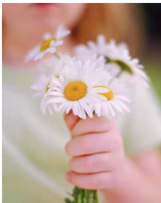
Resource & Referral

Children, Youth & Teen Programs Resource & Referral Coordinator (928) 269-3234 Bldg. #1085A