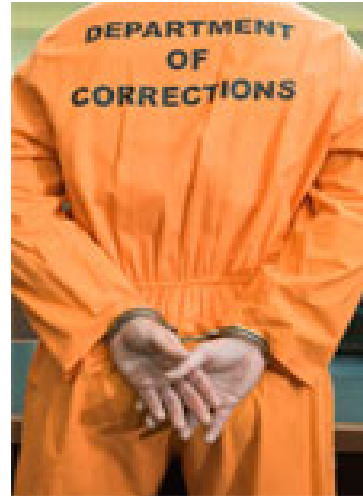
YC Adult Probation